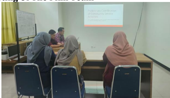
Figure 1. Initial Coordination Meeting of the PKM Team

At this stage, coordination was carried out by a team consisting of 3 Data Science undergraduate lecturers and 2 Data Science undergraduate students on May 8, 2024 in the GKB 2 meeting room, Faculty of Agricultural Science and Technology, Muhammadiyah University of Semarang. From the results of this coordination, an idea was obtained to carry out International Community Service by conducting Google Data Studio Training at SB Sentul Kuala Lumpur Malaysia.