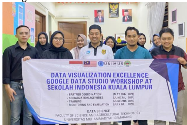
Figure 5. Monitoring and Evaluation

The monitoring activity was carried out on July 8, 2024. This activity aims to provide assistance in creating a dashboard with Google Data Studio. This monitoring and evaluation activity was attended directly by the Vice Chancellor 4 Representatives of LPPM Universitas Muhammadiyah Semarang, the service team, the Principal of SB Sentul Kuala Lumpur, Students, and Students of Universitas Muhammadiyah Semarang. The monitoring and evaluation activity also provided space for Partners (SB Sentul Kuala Lumpur Managers) to convey several things related to the use and importance of knowledge in creating a dashboard with Google Data Studio.