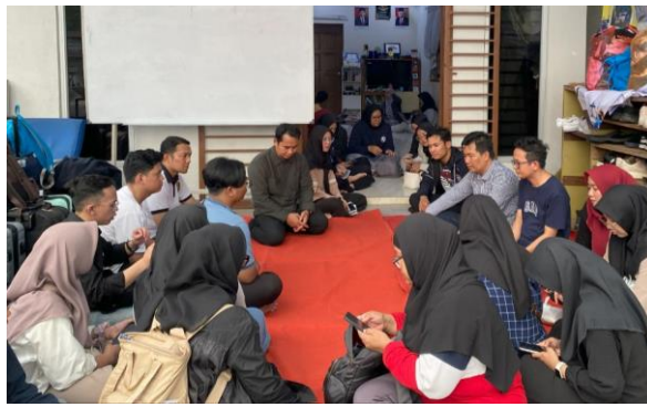
Figure 2. Coordination of PKM Implementation Plan with Partners

From the results of the discussion activities with the Principal of SIKL Sentul Kuala Lumpur, from students who have the need for human resources in increasing knowledge, especially in the field of information technology, it is very much needed to increase insight and job opportunities in Malaysia. Therefore, the Community Service team carried out coordination activities on May 20, 2024 to facilitate the process of Training in creating data visualization dashboards with Google Data Studio at Sekolah Indonesia Kuala Lumpur.